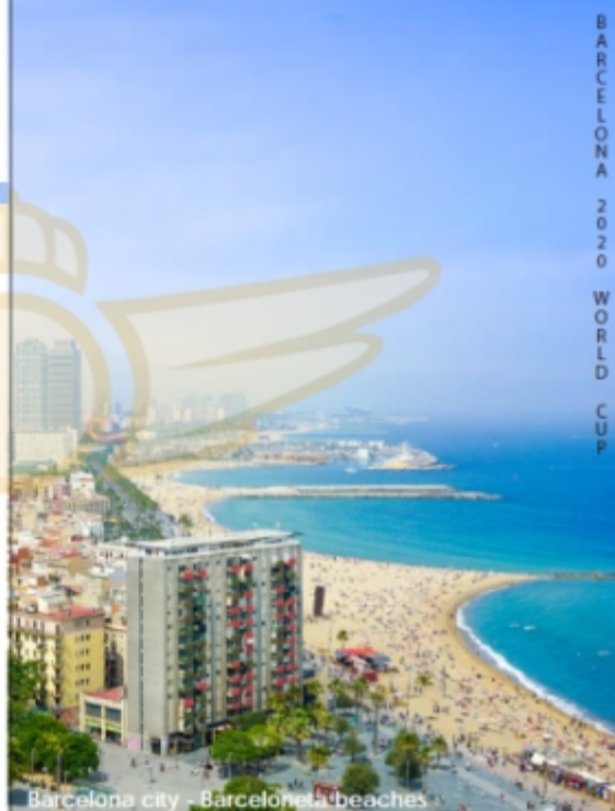
Barcelona city - Barceloneta beaches