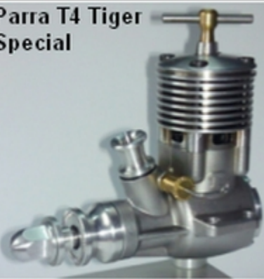
Parra T4 Tiger Special

Alberto Parra is offering a limited number of Parra T4 Tiger engines for 220€ with shipping included. Normal price for the engine is 270€ plus shipping. The 168g engine can easily pull a 8x6 prop in Vintage Combat events or even a 10x6 in stunt. All the details for this engine and many others can be found at: http://control-line.eu/engines.html Alberto's e-mail is: albparra2@gmail.com