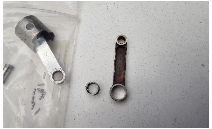
One version of this engine used a needle bearing connecting rod. I understand, the bearing roller cage is one of the more difficult/delicate parts to make. I don't know if the roller bearing rod was worth all the extra effort compared to the regular type of rod.