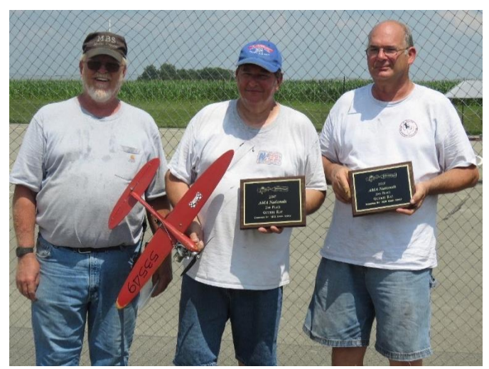
The Prez says... Look inside for part 2 of his Quickie Rat Article.

INSIDE: District Reports Quickie Rat Article Pt. 2 "Déjà vu" Article Pt. 2 Plum Crazy Sport Goodyear Suppliers/Equipment Updated Contest Calendar