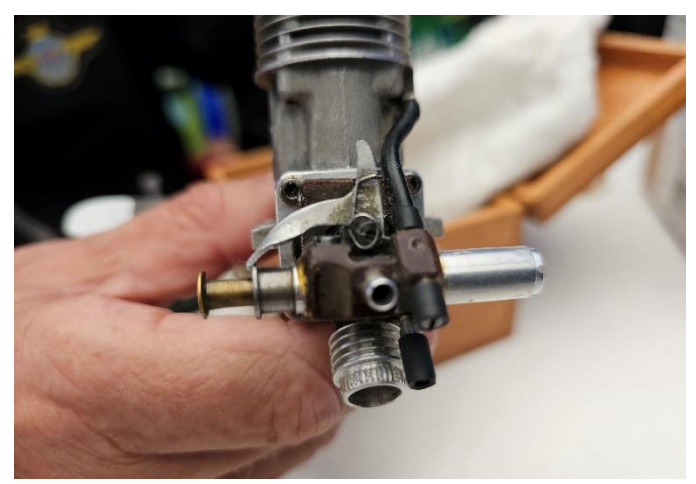
This engine incorporates a rear drum valve with (I think) at least a 5 function shut-off valve).