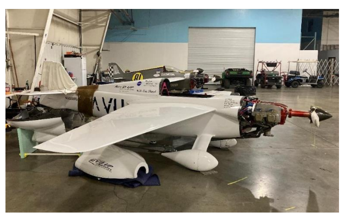
"Déjà vu" with cowling removed showing prop extension and Exhaust routing.

developed what I think are very good drawings for Judy. I got sidetracked in September when we saw Déjà Vu and Bill asked me if I could do drawings of Déjà Vu. When comparing the two planes, you will notice that they both have the Stockbarger wing for reference, however; there is quite a bit of difference that you will notice. Déjà Vu is 2 inches longer, than overall length than Judy, and the elevator and stabilizer sit up higher above the wing center line than Judy does. I have included a photo from the dossier that shows Déjà Vu without the nose cowlings. You can see a very long propellor extension which makes this nose very long on the airplane. My guess is that Jon Sharp designed Nemesis this way to streamline the nose instead of having a blunt nose found on the original Shoestring. Also, Déjà Vu has a huge air intake and exhaust tunnel under her chin. Yes, this is scale, and yes, this is typical of current Formula 1 airplanes today because the exhaust header exiting this tunnel formation is faster than the exhaust coming out of the cheek cowl bottoms. Overall, the fuselage outline is a bigger plan form than Judy but every man has his own interest and maybe this design will float your boat.