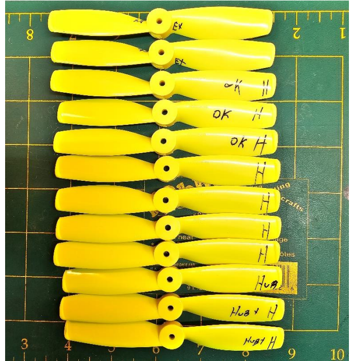
Getting the perfect prop. Of this batch of 12 seemingly identical props, only 2 balanced correctly, 3 had the hub out of balance and 7 had one blade heavy. This is only to show you that to the discerning flier, not all identical looking props are identical. Obviously, production defects are built in. In this particular case maybe a reader can tell me WHY exactly these come out this way... I've encountered the same phenomena in all other manufactures as well. Even those who advertise that their props are factory balanced!

I have to admit I wouldn't normally give this thin (250 Euro) paddle blade prop a second look. That is until I saw it perform on the Czech world champions racer. Then all doubt was removed and I can see why it commands its price. Not apparent is this prop needs to swing forward & aft to extend the life of the engine bearings. Who would have thought?